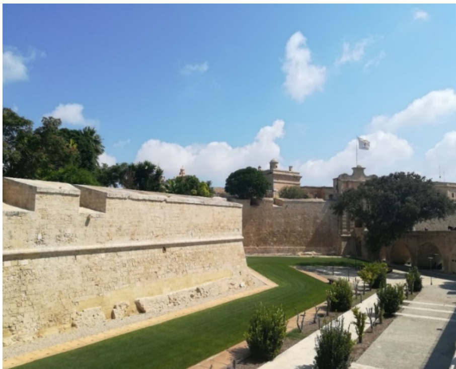
Fig. 4. The walls of Mdina

The ancient Maltese capital offers a rather evocative view and, at the same time, numerous structures of the past 59 some of which, appropriately recovered, have been revalued and used today in a modern way. Mdina is therefore a destination for a type of "historical" tourism 60 , which has highlighted its great potential and made it famous. Among the most important buildings that have undergone revaluation processes stands the ancient Carmelite convent 61 (Fig. 5), whose cellar now houses a restaurant: