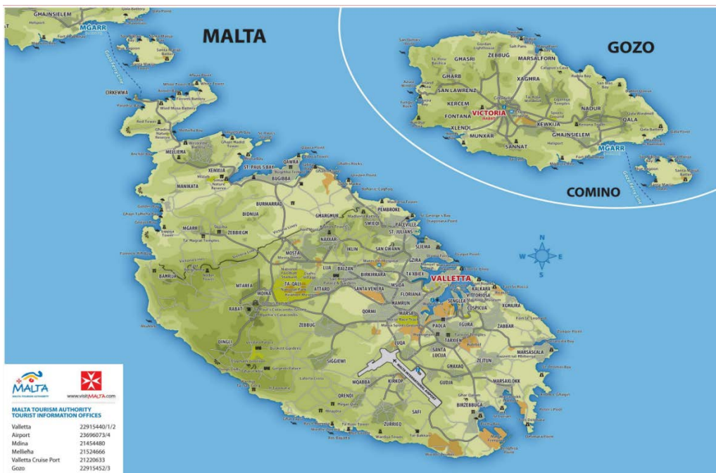
Fig. 1. The Maltese territory 15

One of the European nations that makes tourism one of the activities par excellence for the development of its economy is Malta, an archipelago (Fig.1) in southern Europe, a member of the European Union, located in the Mediterranean at about 80 km from Sicily, during its history has undergone the influence of all the different human groups with which it has come into contact. The official language is English, Maltese is commonly spoken, but Italian is also known, given its proximity to Italy.