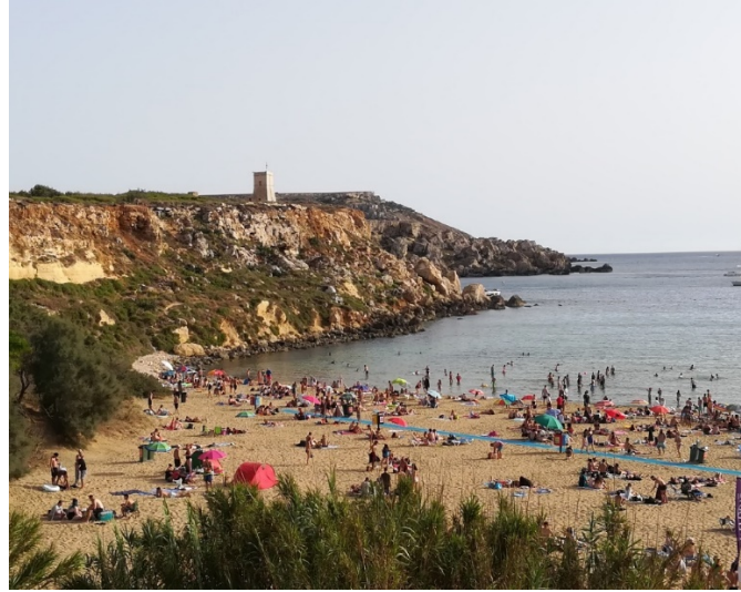
Fig. 7. Golden Bay beach

During the summer it is the most popular place for seaside tourism due to its proximity to hotels and restaurants and its accessibility to public transport.