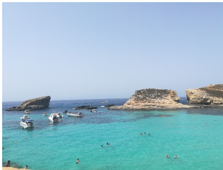
Fig. 8. One of the most striking views of Comino

Very close are also the two neighboring islands of Gozo and Comino (Fig. 8), easily reachable by ferry and rich in historical and artistic heritage.