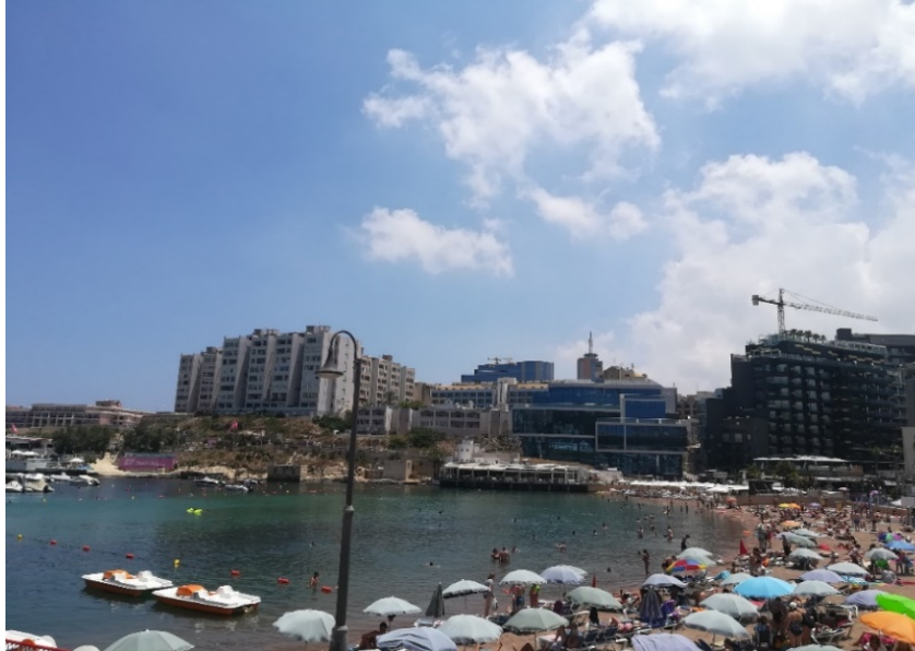
Fig. 6. The beach of San Giuliano

It is therefore a very popular area especially during the summer, while in winter it attracts a good number of young people, especially on Saturday nights. The bathing area is particularly renowned (Fig. 6), one of the most appreciated areas: