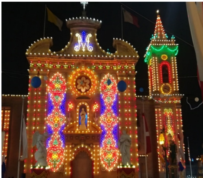
Fig. 3. The illuminations for one of the religious festivals held in Malta

Both in Sicily and in the Maltese area, religious festivals are characterized by lights, fireworks and the presence of bands, traditions that have remained intact in both nations over time. The same applies to the village festivals that are organized in small towns in Sicily, on the occasion of which some of the most important culinary traditions are promoted. In Malta the same happens in particular in Mdina 58 which, being the ancient capital, attracts the participation of both the Maltese and tourists.