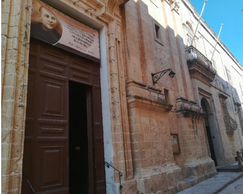
Fig. 5. Church and ancient Carmelite convent of Mđina

Maltese policies have therefore considered the territory of Mđina 62 not only in relation to what the city has represented in the past, but also for its potential and its future prospects. Despite the historical relevance 63 of the ancient Maltese capital, it has, however, some limitations in urban development, which has only affected neighboring Rabat.