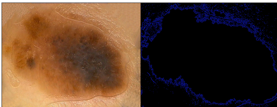
Fig. 3. Incorrectly recognized contours and “false contours” due to imperfections in the videomicroscopic image.

Evident errors of the algorithm were not included in this study, because the aim was not to study the efficacy of the computer vision software, but must be kept into account and resolved to make the system usable in an ordinary clinical environment. Similarly, improvements are needed to identify and remove “false contours” due to imperfections that can be present in videomicroscopic images (figure 3).